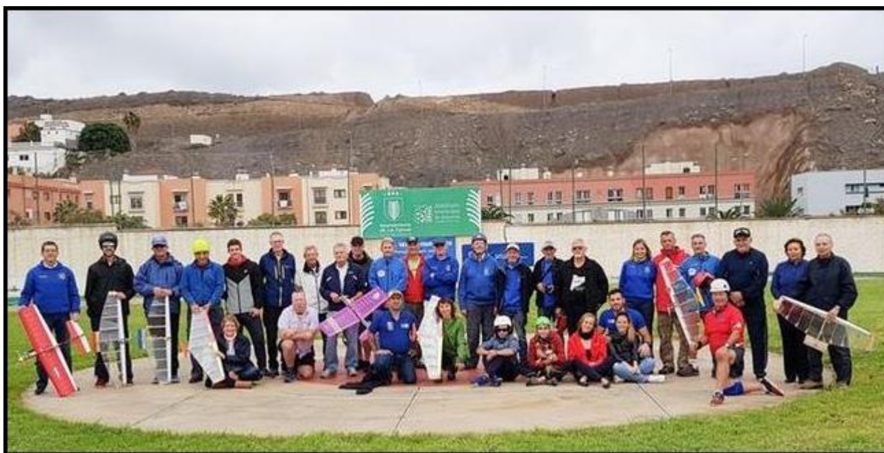
International V&V 2017 Gran Canaria December 15-17, 2017