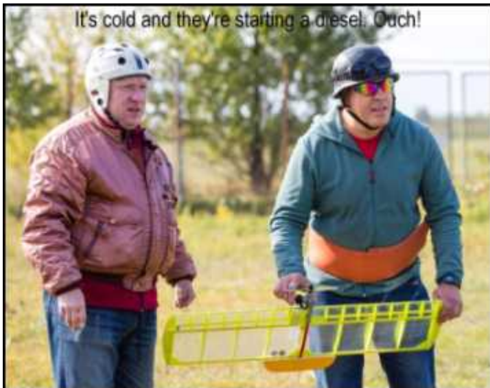
It's cold and they're starting a diesel. Ouch!