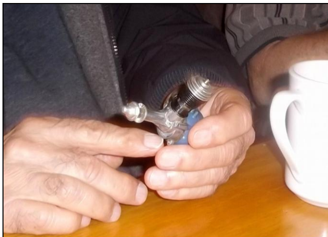
Wayne Esauk showing Vintage 0.049