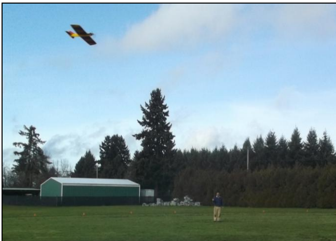
Gary's Flite Streak in the air