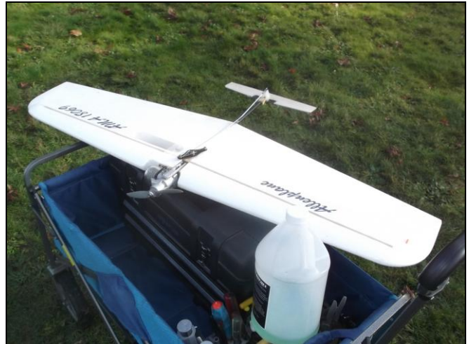
Gene's plane ready