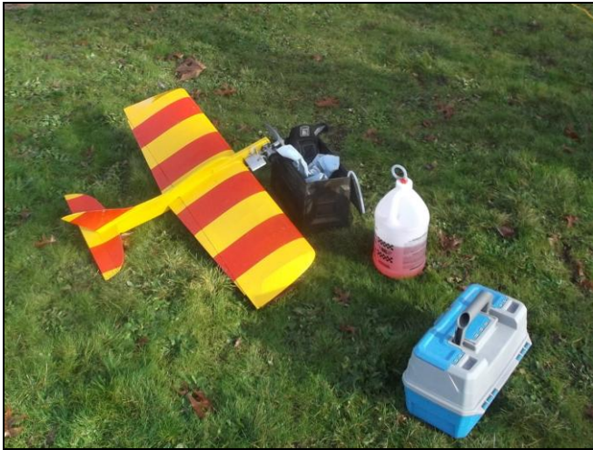
Gary's Flite Streak