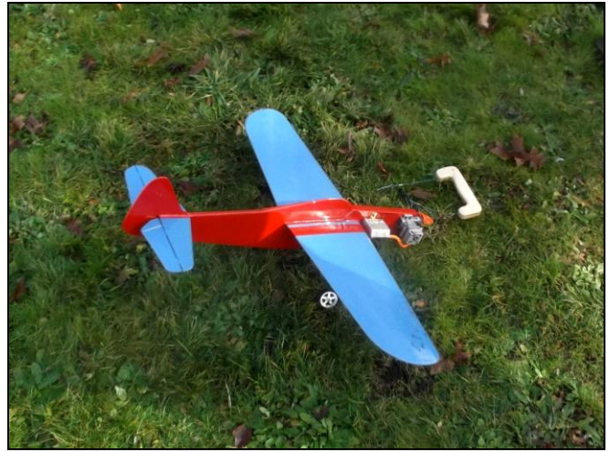
Tim's plane ready to go