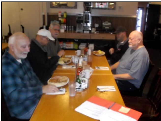
Meet and Eat