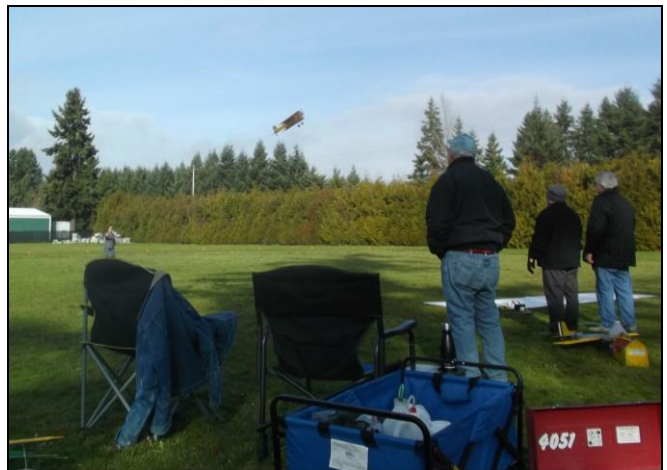
Jim's BiPlane flying