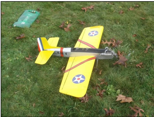
Dave's plane waiting