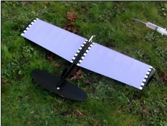
Tim's plane waiting