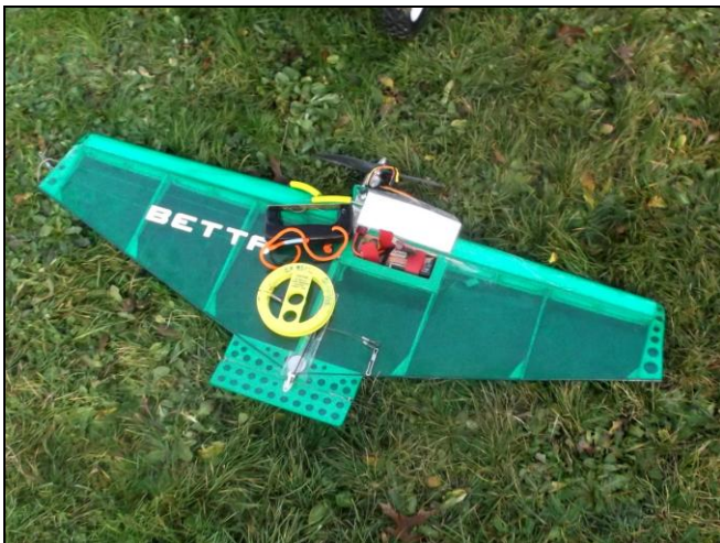
John's Electric combat