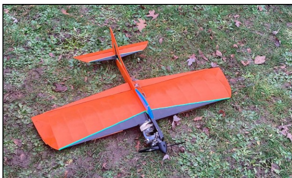
Flite Streak.