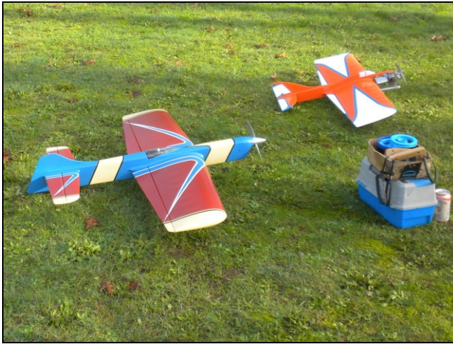
Two of Gary's planes