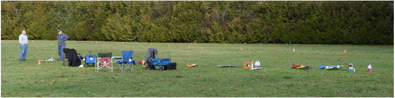
Orchard Point layout.