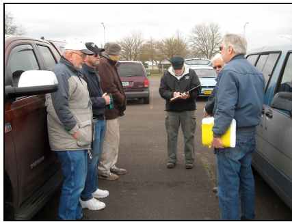
Hiding from the wind