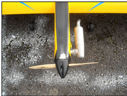
Prop OK, spinner saved nose