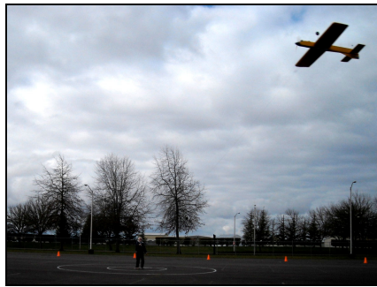
Nice inverted lap