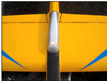
Canopy got it a bit