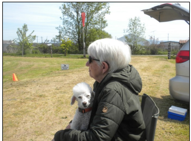
Security and supervision