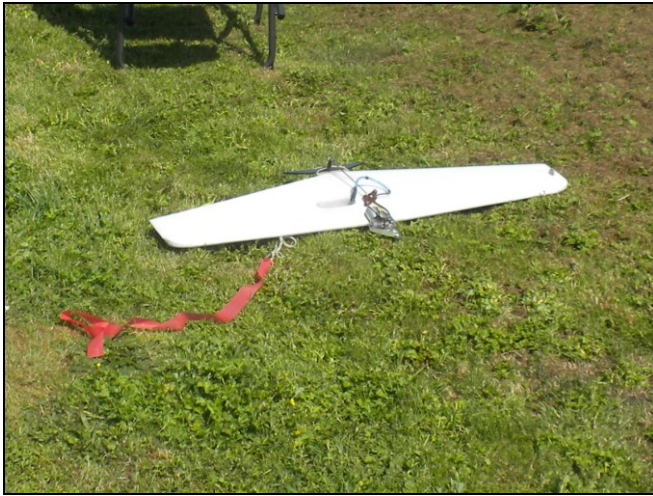
Russ plane combat ready