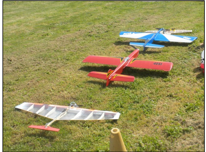
Waiting for a pilot