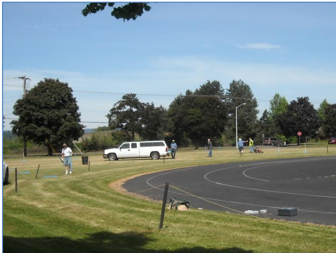
Setting up on Thursday