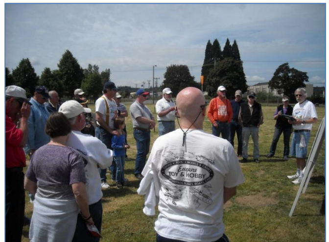
Award ceremony starts