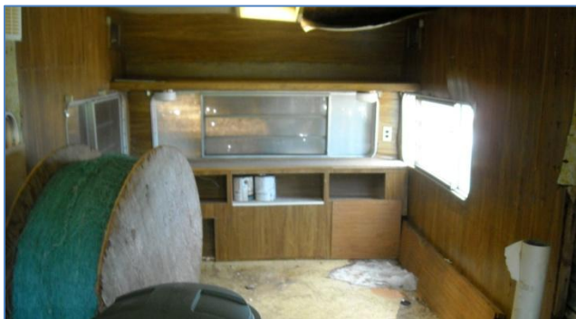
NWR storage trailer nearly empty