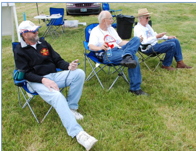
Combat contest crew. Flying Lines photo

http://flyinglines.org/nwstuntcombat.14.html