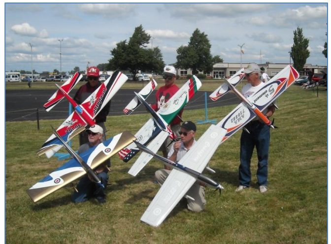
Some of the contestants and their aircraft