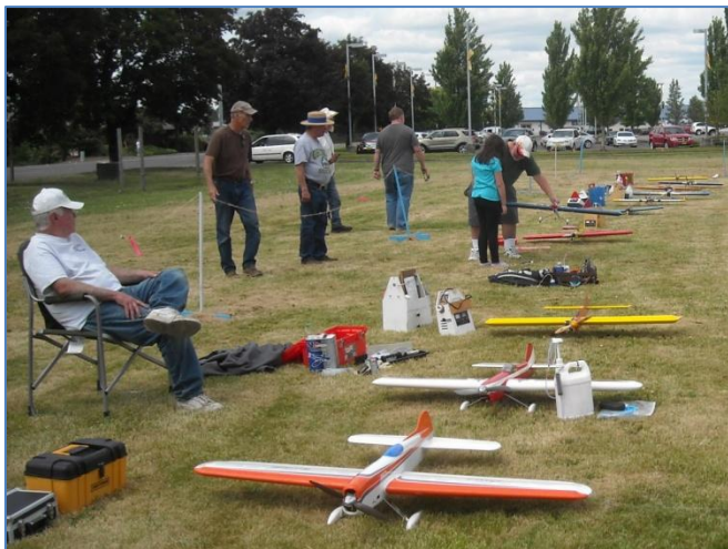
Lining up the airplanes