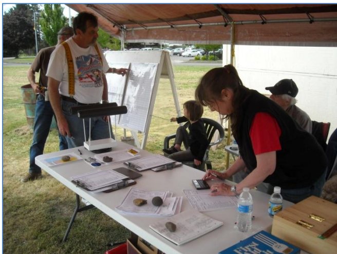
Singing up contestants