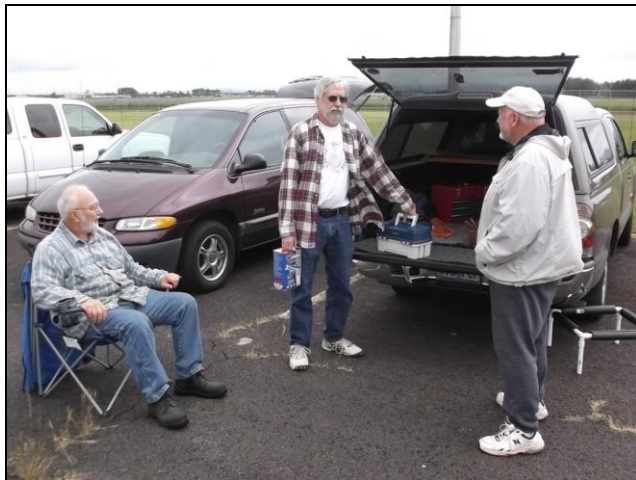
Meeting before flying.