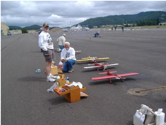
Brothers getting ready.