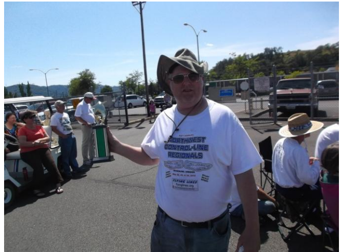
And there were trophies.