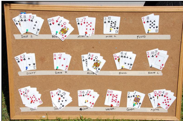
Every flight got a card, and the best hand won -- that was Dave Shrum, upper left.