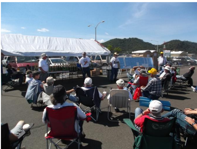
Award ceremony gets a crowd.