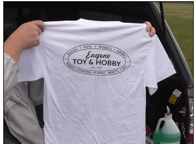
Preview of the regionals shirt.