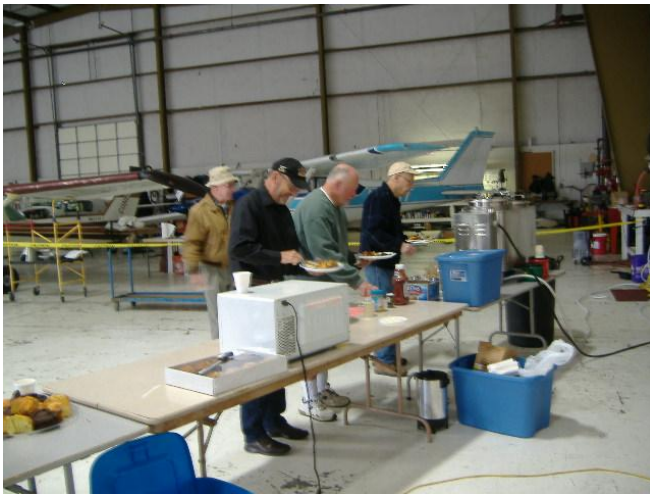
There was food.