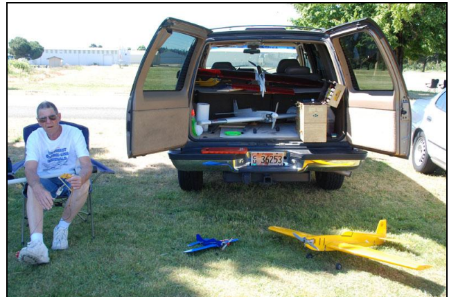
Mike Denlis brought a variety of planes, including the yellow monoline-controlled Tutor.

Mike Hazel reports - Warm and windy skies greeted 16 participants who showed up at LHFF held at the club field of the Western Oregon Control Line Flyers. There were also a few modeling and nonmodeling spectators watching the flying, which was nearly nonstop all day with two circles being used.