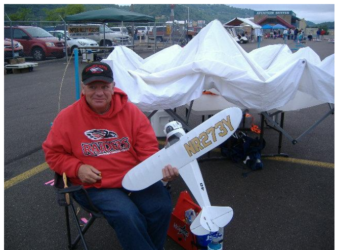
Plane and pilot unscathed.