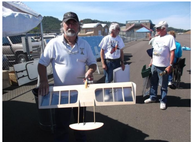
Signed combat plane.