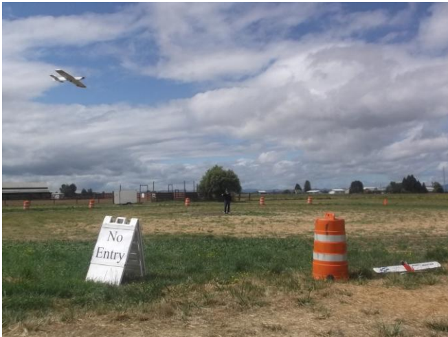
Gavin gets some air time