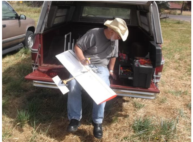
Gene leading a combat plane