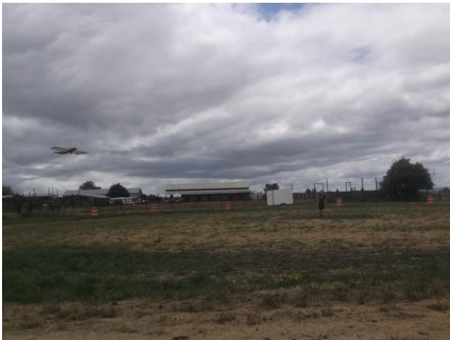
Gavin getting full flights