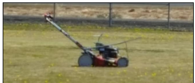
The club's new mower on its first mission.