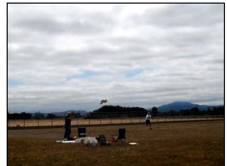
Leaps in the air