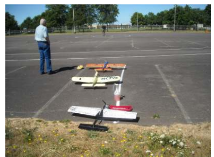
Steve launched it