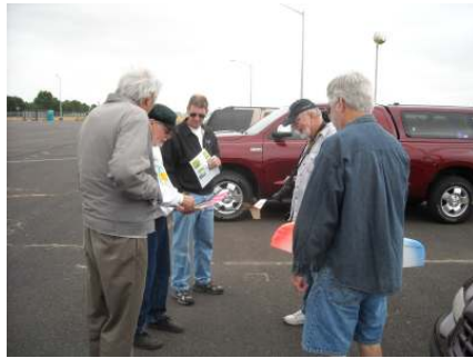
Have a meeting