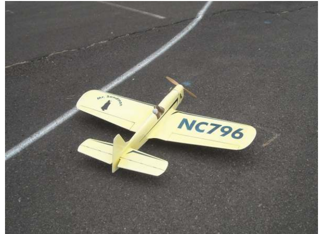
Floyd has it trimmed now