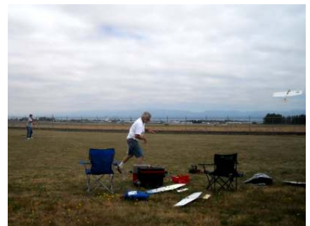
Let-er go - FAST