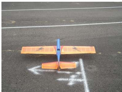
This one does not need fuel