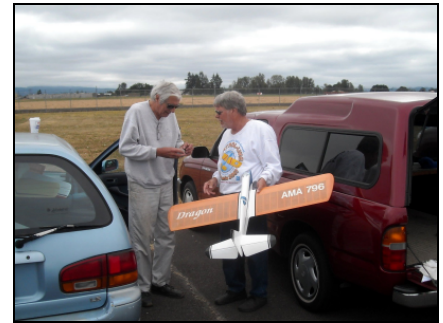
This goes on the front