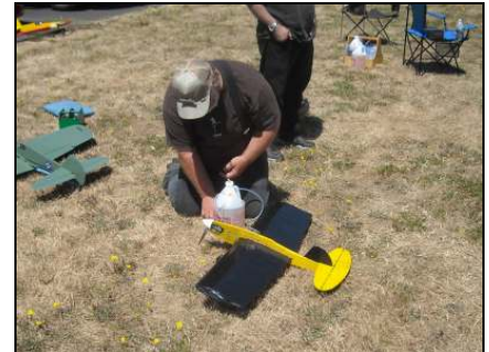
Taking the fuel out