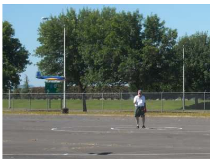
Tom flew it to a