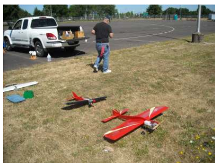
Gene connecting lines