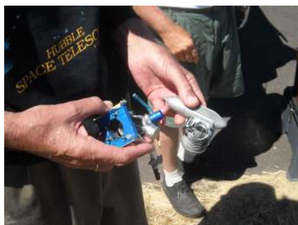
Very hard landing