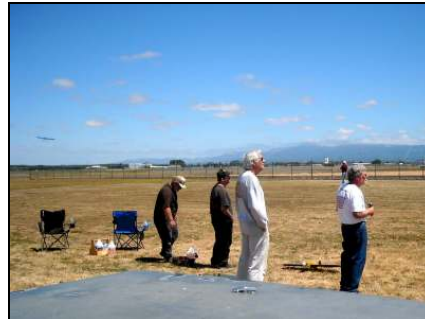
Combat planes are LOUD