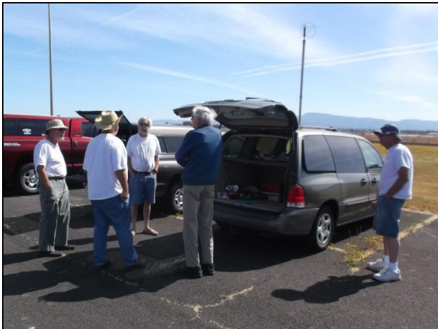
Meeting before flying.

There are some VHS videos on building that are available to any one that wants them, contact Gene Pape soon if you are interested.