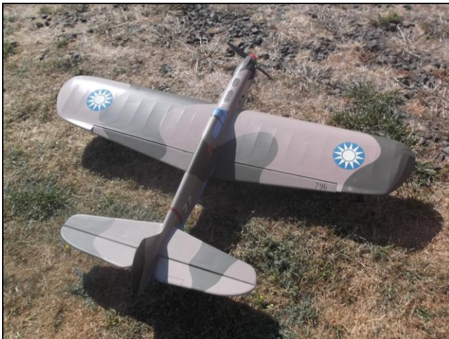
War bird waiting