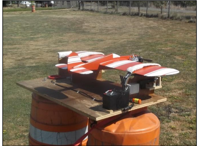
Gary is ready to launch