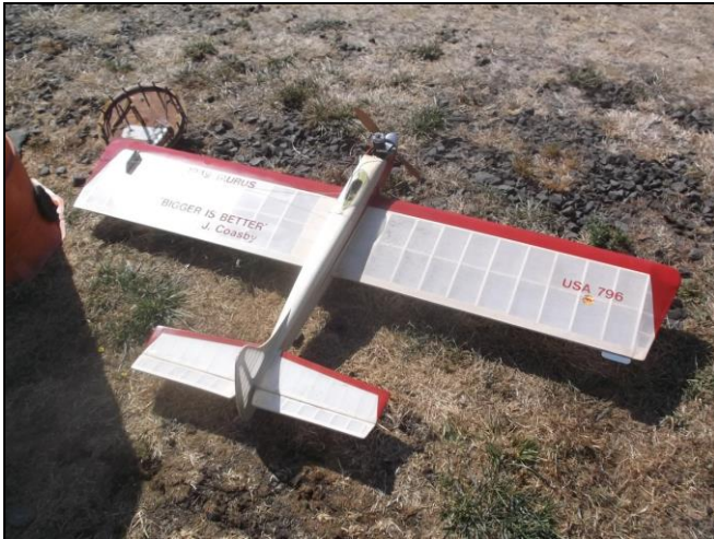
Floyd has it fueled and ready to go