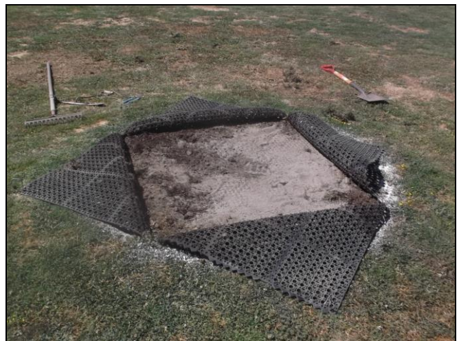
Repairing the center pad.