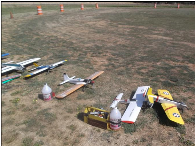
Waiting to fly