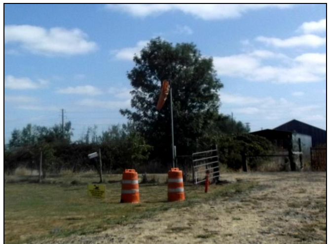
Just enough wind to fly