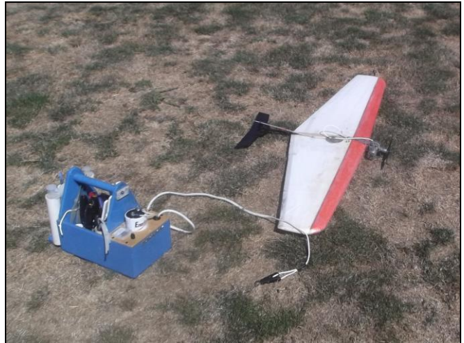
Russ's 80 mph combat (0.25)