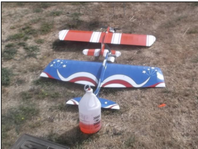
Have fuel, needs pilot