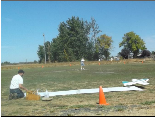
Launched by Gary