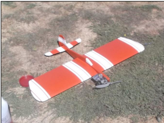
Looks fast even when resting