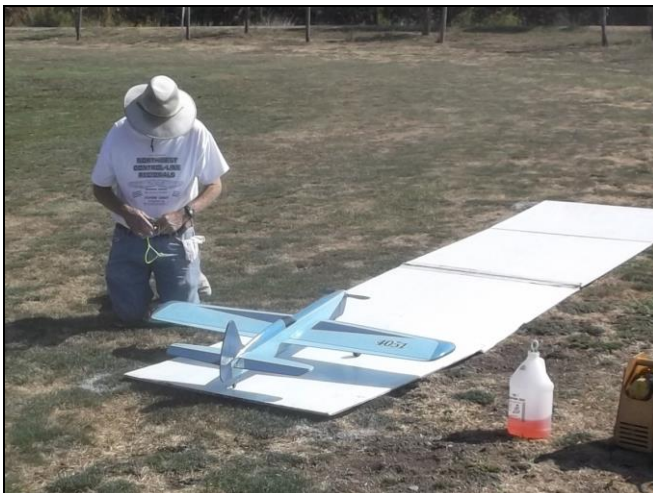
Lines being attached