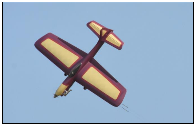
Gary Weems' Skylark in flight.