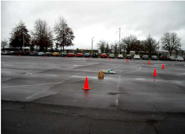
Sharing the field with rental cars.