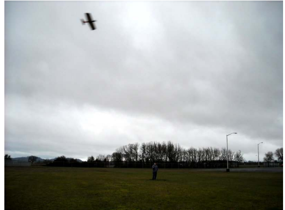
Fly it right side up.