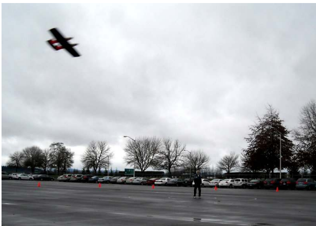
Evil not intimidated by the wet surface.