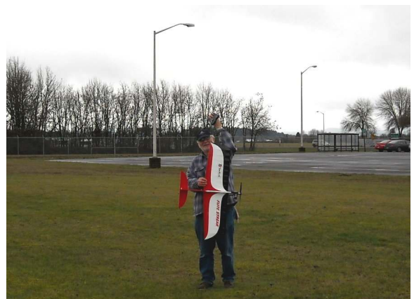
Smiling after a maiden flight says it ALL