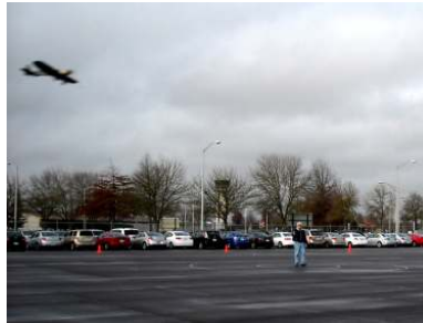
Mike looking Smooth