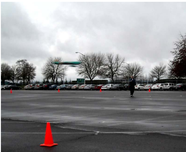
Ares in the air!