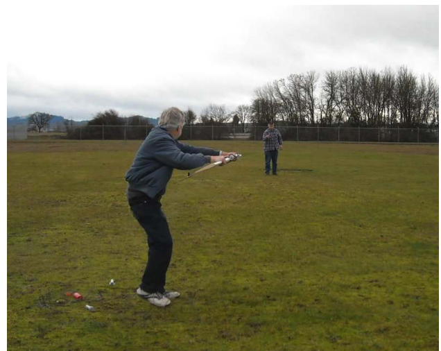
Maiden flight launch of Gene's Dogfighter