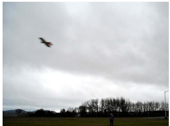
Up side down. (nothing fell off)