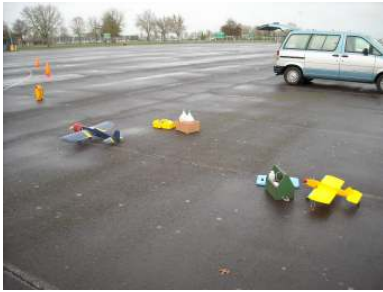
Fewer planes than usual