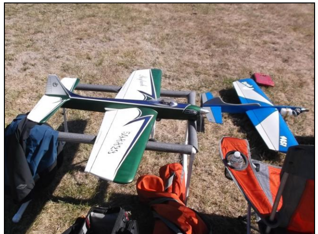
Plane on stand is Bruce Hunt's electric Skylark