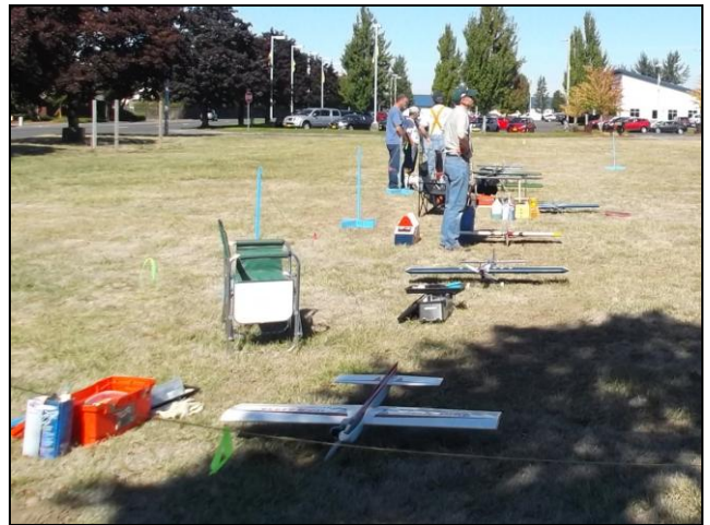
Saturday pit lineup