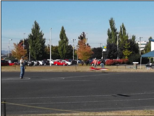
Gordon Rea in flight