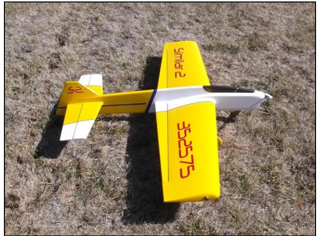
Fred Underwood's Similar 2