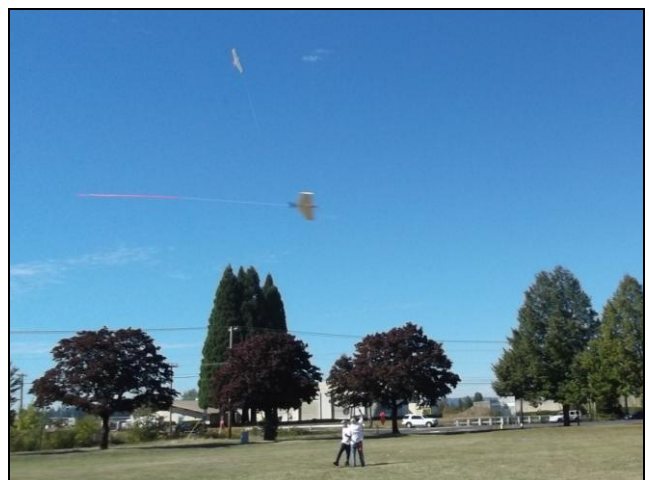
Combat match in action