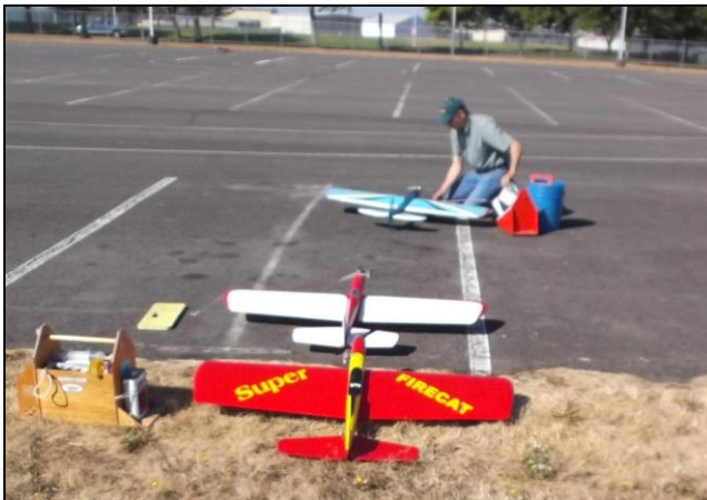
Ready for fuel.