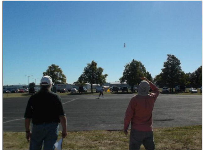
Judges watch an official flight