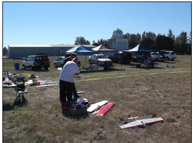
1/2-A combat pits