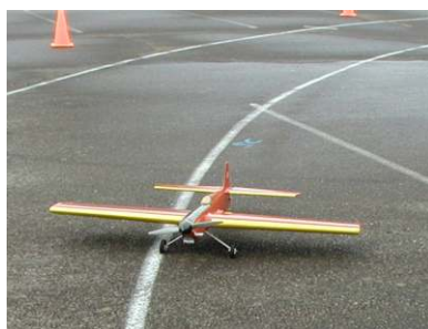
Let go NOW!