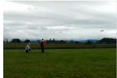
Christopher in training