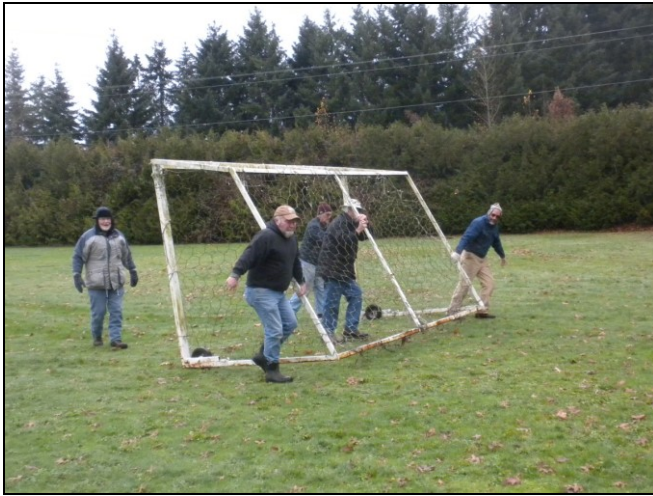
Preparing the flying circle