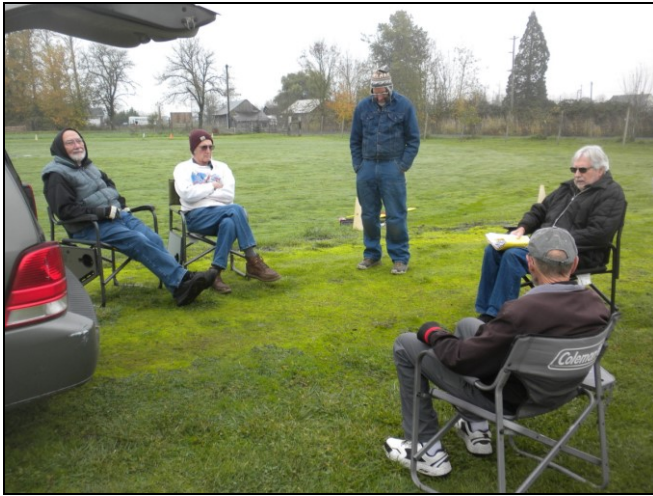
Meeting about to start