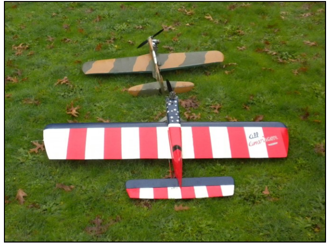
Dave's planes waiting