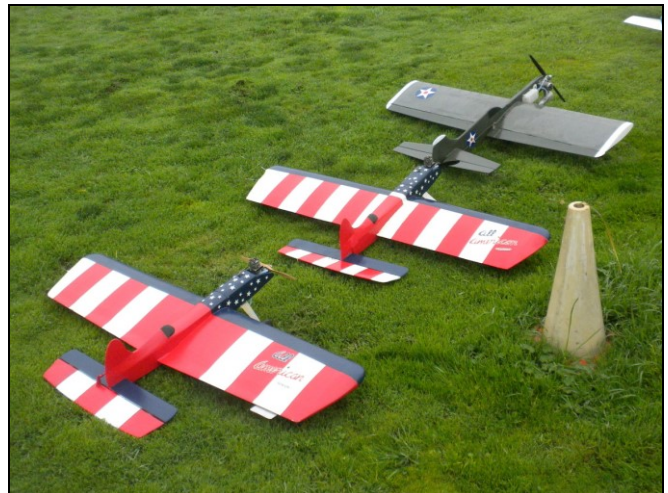
Dave has three ready to fly