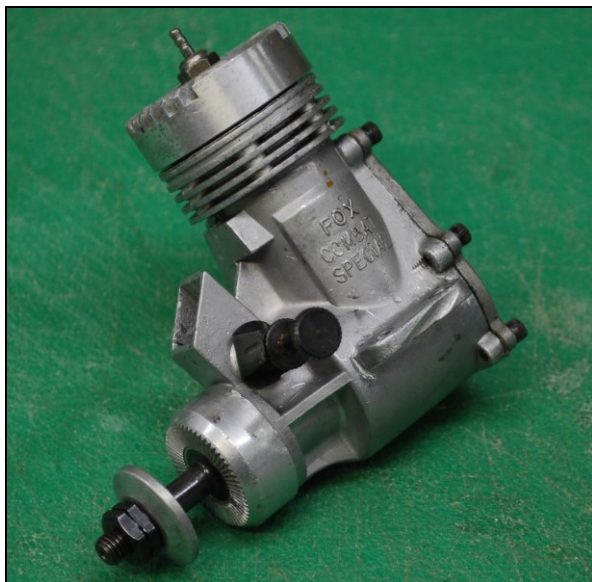
Fox Combat Special Mk III