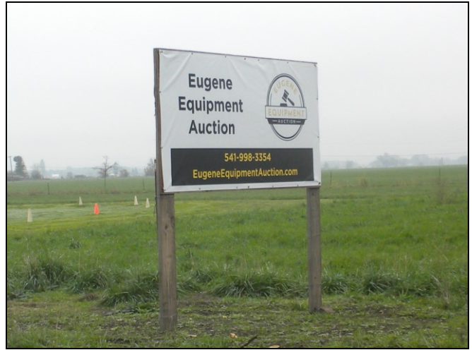
New sign at entrance to ranch