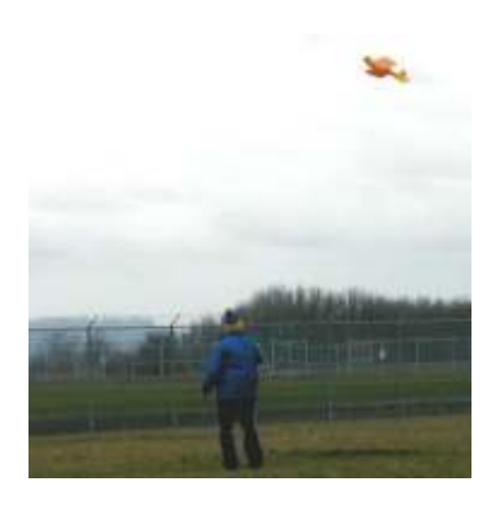
Jim Corbett Photos