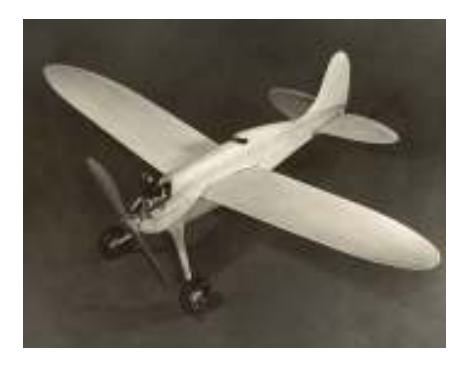
A 1938 Fireball – this was the first Control Line model kit.