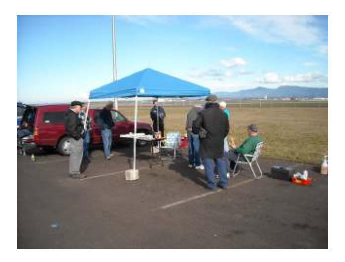
A short meeting.