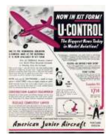
1940 American Junior Advertisement