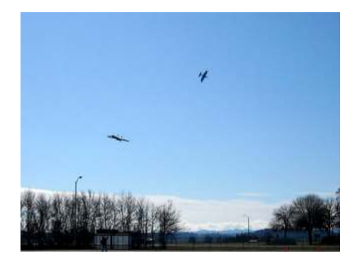
Two circles in use at the same time.