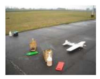
Lots of hanger space left.