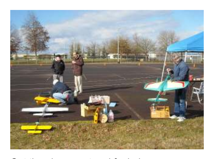
Get the planes out and fueled.