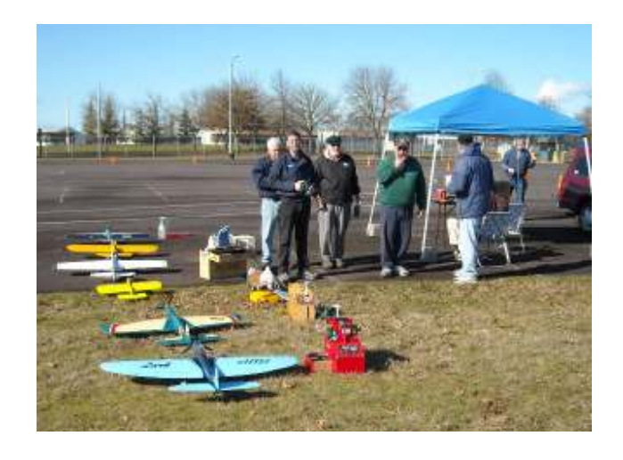
Talk about it for awhile.