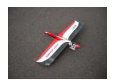
Jim's inverted training.