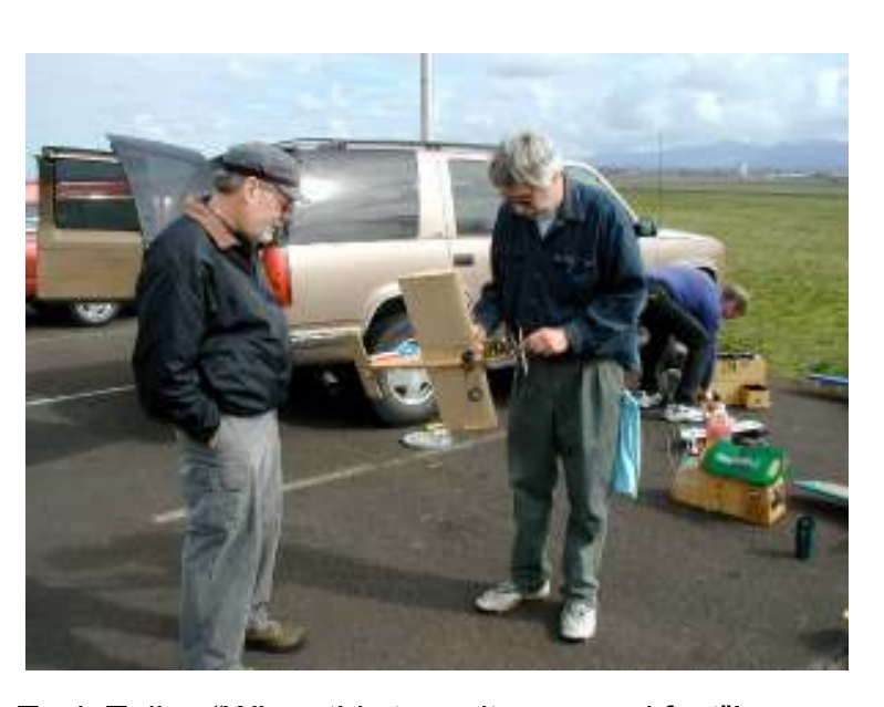
Tech Talk – "When this turns it goes real fast"!