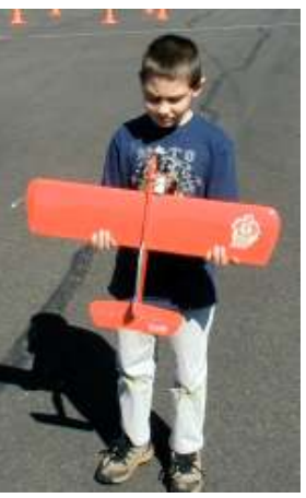
Any attire is OK with an airplane attached.