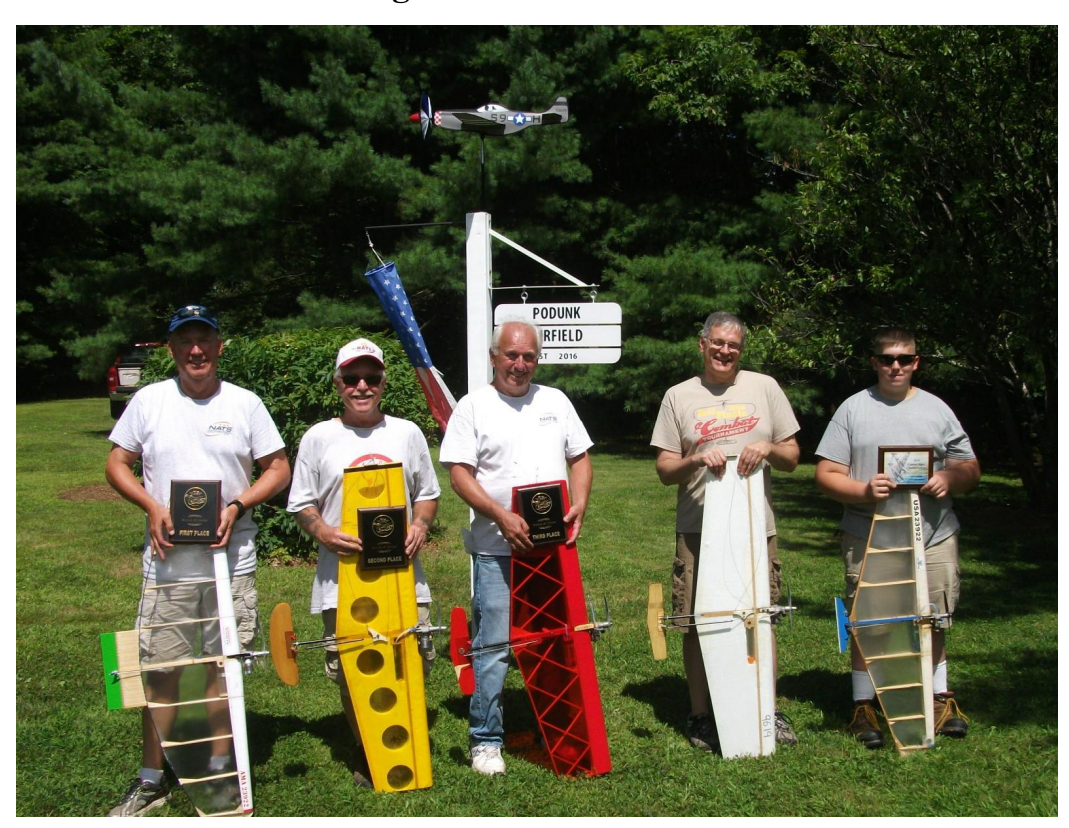
The top finishers at the 2019 Central Mass Championships