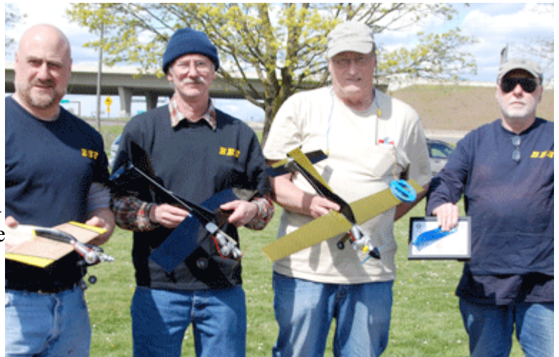
The Broadway Bod Busters with their F2D

8 laps (1/2 mile) from release 3 attempts at one official