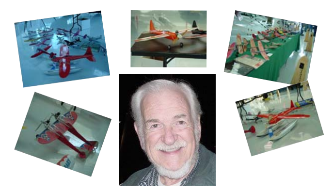
Please consider yourself invited to do a write-up on this event.

Any of you guys have anything to offer on this subject? This was my volunteer day and I had little time to spend near the exhibit.