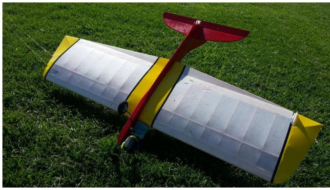
Flite Streak: Full power on crash with no wing damage at all!