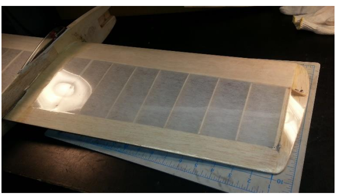
Finished! The SLC covering goes on very easily over the bare Polyspan.