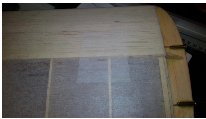
"Hangar Rash" shop punctures are a snap to patch at this stage.