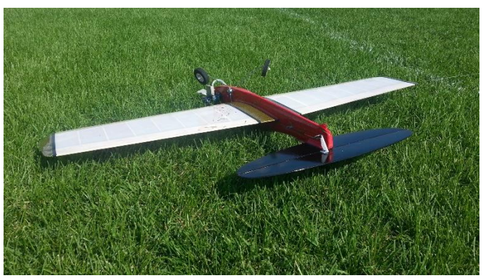
Ringmaster: Full power on crash with no wing damage (will need LG & prop work thought)