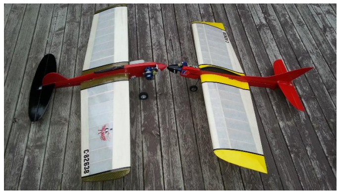
Worked so well on my Ringmaster, I had to do it on my Flite Streak.