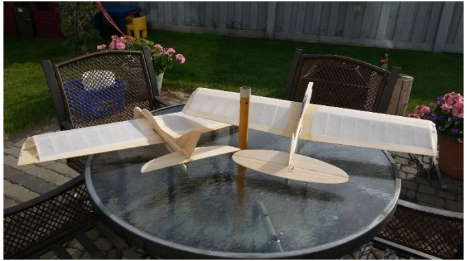
Both Flite Streak & Ringmaster are drying outside after the Polyspan has been applied.