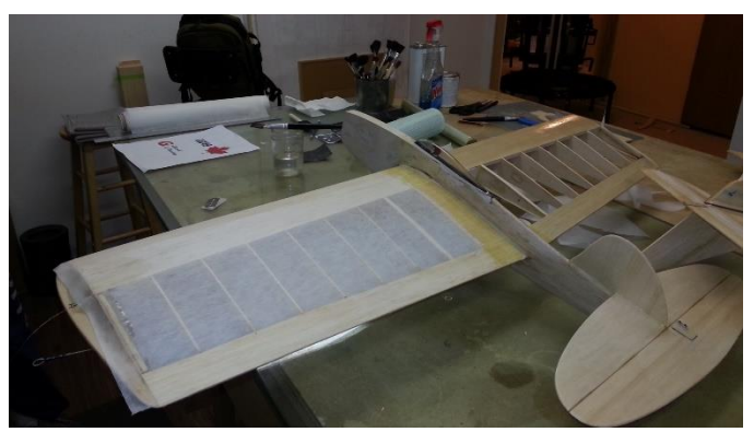
Shown below, the first wing panel with doped Polyspan has gone on quite nicely.

BTW, process designer Larry Renger has notified me that the (Non Smell) product Mod Podge, the waterbase sealer glue and finish available from many craft stores can be used as a substitute for dope. Thin as required.