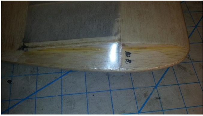
The SLC is a snap going around complex wing tip curves.