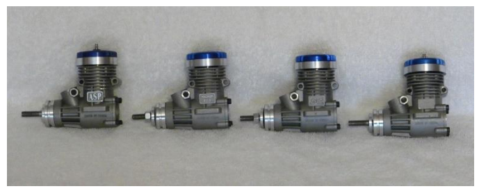
What do we call you today, ASP, magnum, SC or?

The point of all this, as far as Sportsman Goodyear is concerned, is that these engines can be considered identical, and therefore legal. I have personally inspected them, and upon visual inspection, they all look the same. This is NOT a get out of jail free card for cheating contestants, though, so be forewarned!