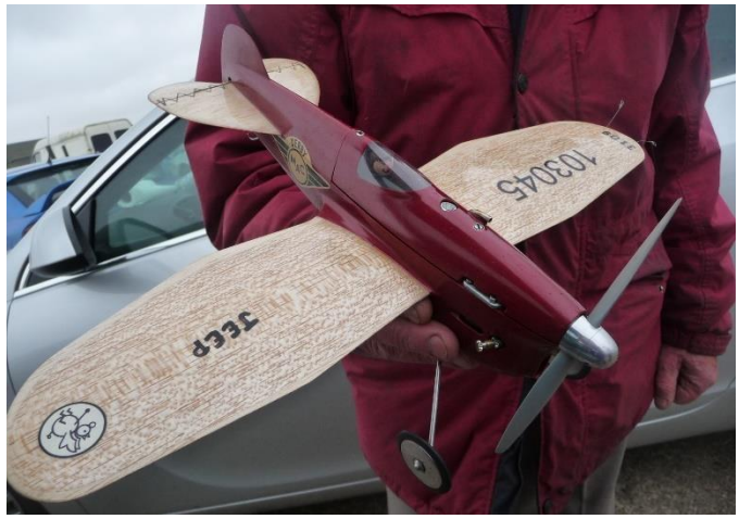
Another gorgeous Vintage 1/2A model built by Ken Newbold.