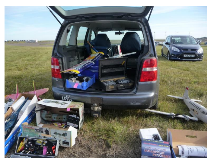
Just one of about 200 vehicles at the "British Boot Sale" swap meet on site. One can find most anything from vintage C/L, F/F, R/C to a myriad of collectable engines, books & magazines. Vendors are from all over Europe.