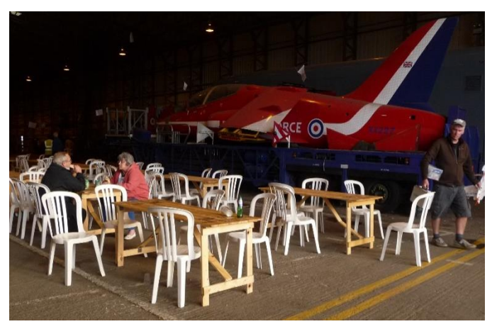
The Nats beer tent was packed every evening where modellers gathered to tell outrageous stories. Great fun!