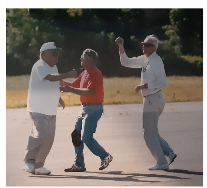
This looks like fun; I think it would pass for F2C flying.