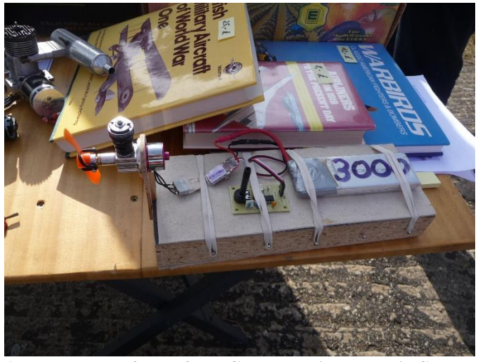
A rather clever fellow from Germany displayed his Cox .049 converted to electric. Electric Mouse race anyone?