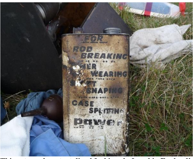
This extremely potent diesel fuel is only found in England! Formulation is a proprietary blend...