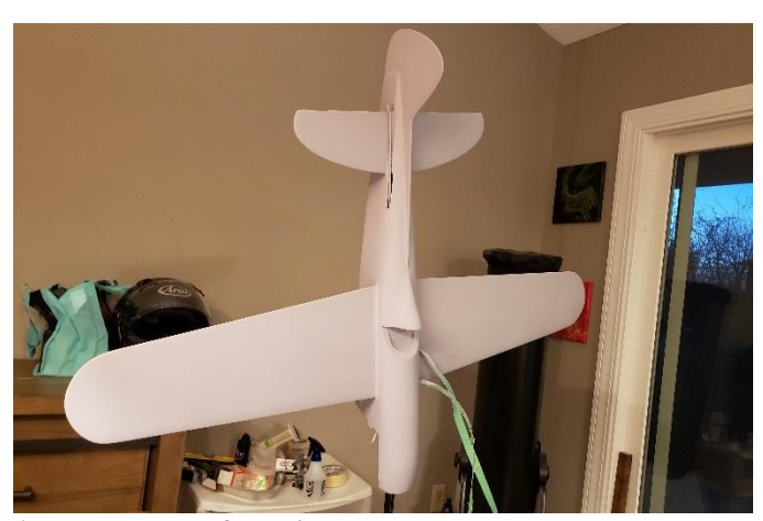
And now, ready for paint.

I am still plodding along on my Good News for VBT/R, she's in primer now and being sanded! Speaking of primer, I have some thoughts on Rustoleum 2-in-1 Filler & Sandable primer, but I'll boil it down to don't bother using it. Typically I use KlassKote primer or Duplicolor in a pinch, but I was out of both, and I needed to get going on this thing, so I decided to give this Rustoleum stuff a shot. Wow, does it clog paper. I tried wet and dry, three different grits, and three different types of abrasive, and it was a total joke to sand. The only way I have figured out how to sand it is to wet sand with 220 grit until you are about 75%-80% of the way there, and then switch over to 500 or 600 wet for the last little bit. I'm not a super huge fan of being that aggressive to start with paint, but the product is apparently aimed at people who don't know any better. Typically the coarsest I'll go with a primer is 320, but that's just me. It's also an insanely high solids primer, and at least with the 220, will start making massive amounts of mud pretty quick!