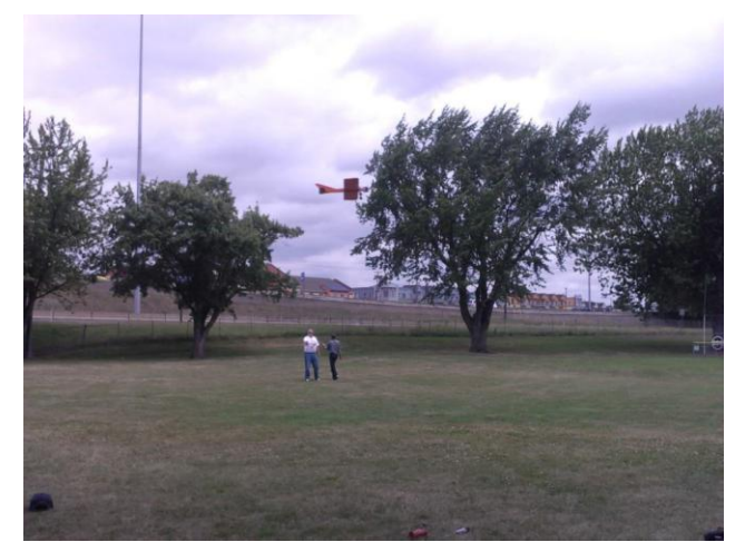
Photo 4: Jim Cameron and Ron Anderson Fly Doubles. This is the most fun you can have flying level!

The Aeroliners kicked off the traditional start of summer, July 5, with a big Bang—their Independence Day Fun Fly at East Delta Park, in Portland Oregon. For a first time event, held on a week day, the turnout was quite good, with 11 folks coming for some good food, flying, and general control line camaraderie.