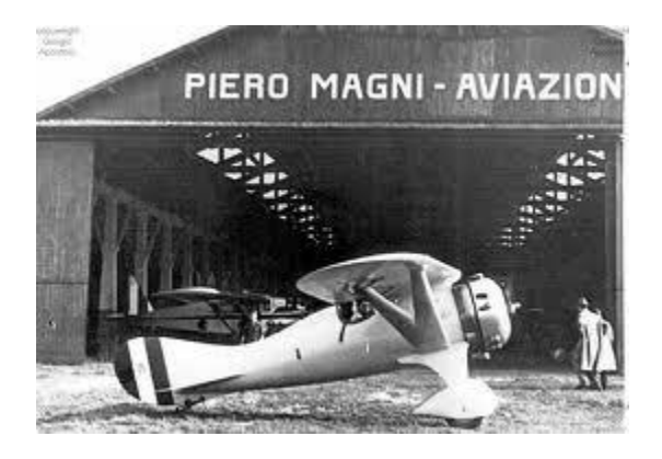
In our last issue, I published a three view of the rather neat little gull wing

monoplane with very clean lines, for a radial engined plane. Well, leave it up to the Italians to produce such a beautiful, and artistically designed little plane.