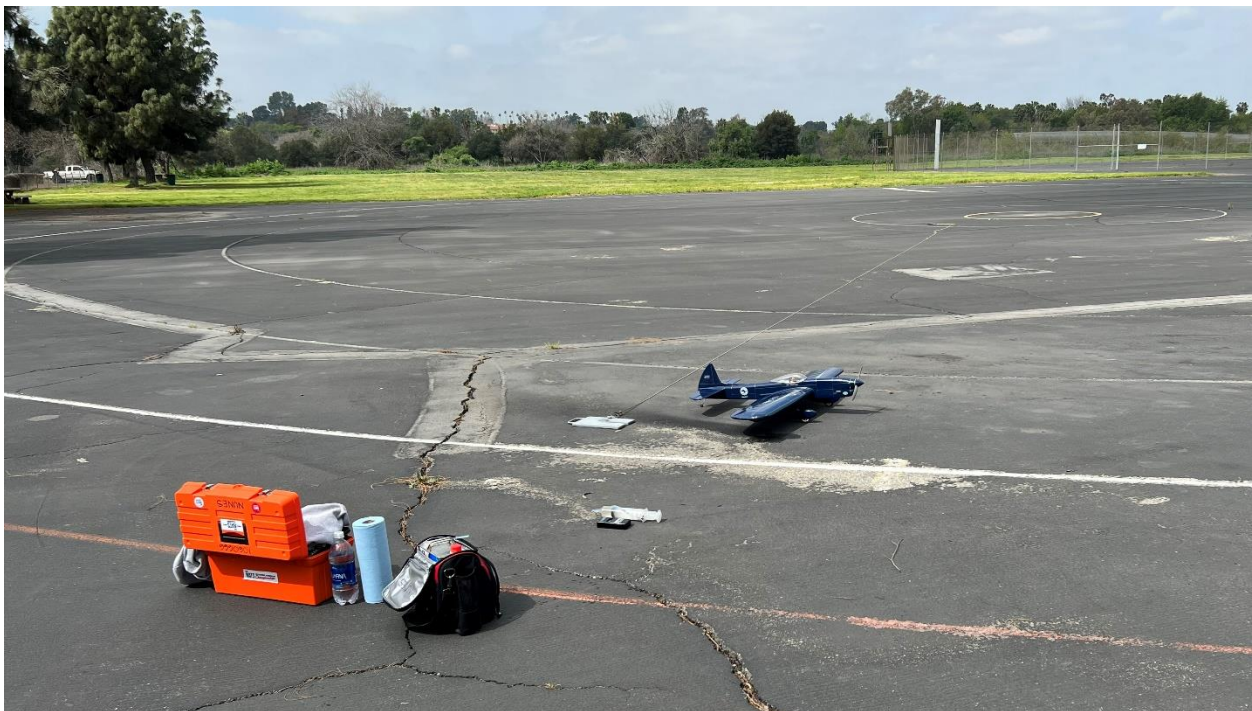
Practicing at Whittier Narrows Late Monday Morning

Once I arrived and with my stooge in hand, I was able to put in 6 practice flights in some very unstable, swirling air that went from calm to 5 mph, and every conceivable direction you can think of during the flights. However, this did work out well as I was more concerned about getting a good engine run rather than focus on flying the pattern. The ride back to Tim's house was better. It only took me 2 hours to get back.